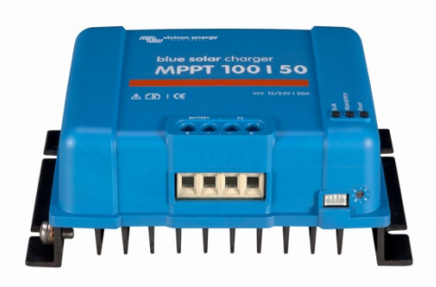
Solar Charge Controller MPPT 100/50