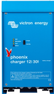
Phoenix Charger 12 V 30 A