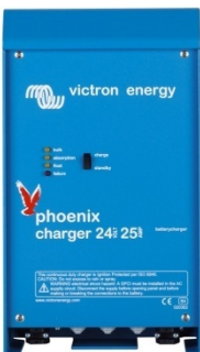
Phoenix Charger 24 V 25 A

To learn more about batteries and charging batteries, please refer to our book 'Energy Unlimited' (available free of charge from Victron Energy and downloadable from www.victronenergy.com ). For more information about adaptive charging please look under Technical Information on our website.