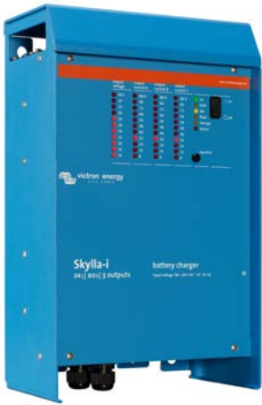
Skylla-i 24/100 (3)