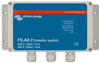
Filax-2: ultrafast transfer switch