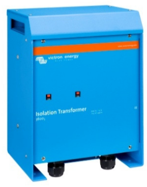
Isolation Transformer 3600W