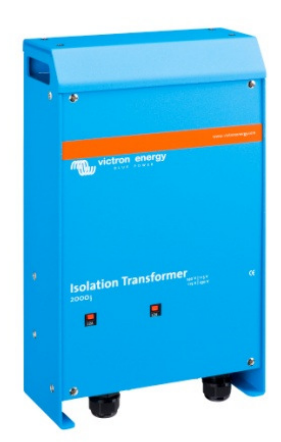
Isolation Transformer 2000W