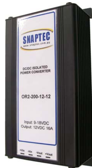
100W , 200W models