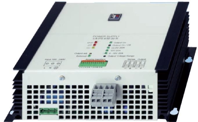
Power supply without digital interface