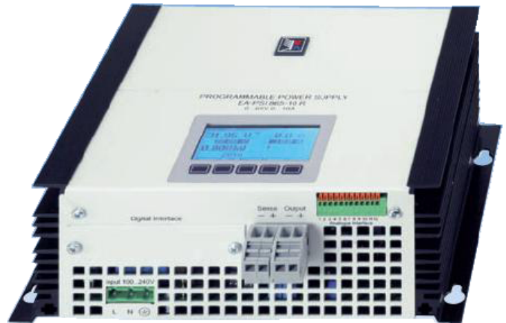
Power supply with digital interface