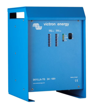
Skylla TG 24 100