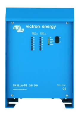
Skylla TG 24 50