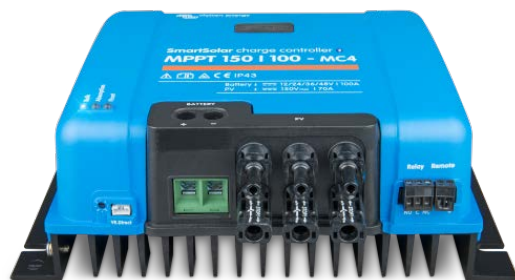
Solar Charge Controller MPPT 150/100-MC4 without display