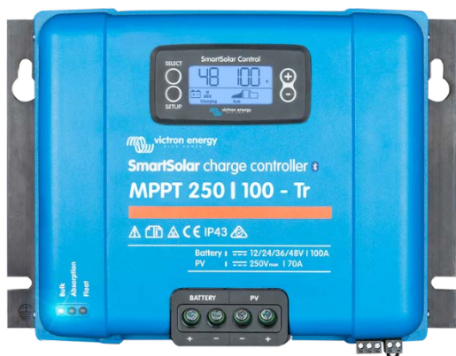
Solar Charge Controller MPPT 250/100-Tr with pluggable display