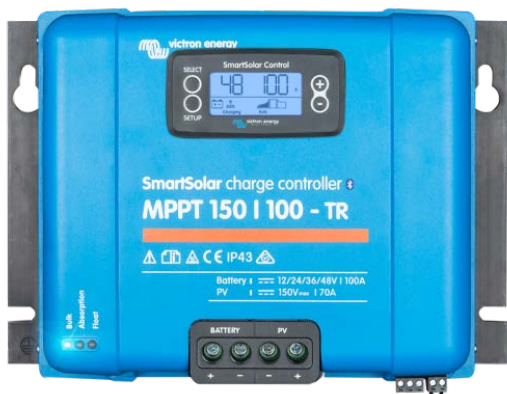
Solar Charge Controller MPPT 150/100-Tr with pluggable display