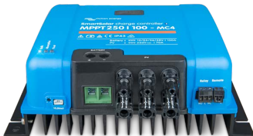
Solar Charge Controller MPPT 250/100-MC4 without display