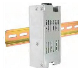
DIN RAIL MOUNT