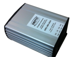
360W models Version 2